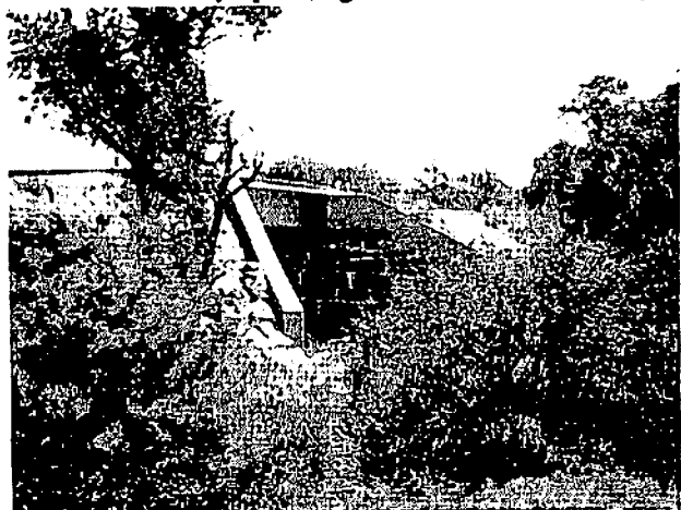
Rebuilt Jones River Bridge, off Landing Rd., Kingston. Notice new concrete poured around old stonework.

By today's fare structure, Kingston will be a "Zone 8" classification, with a 12-ride ticket costing $40. An MBTA monthly pass, good on all modes of