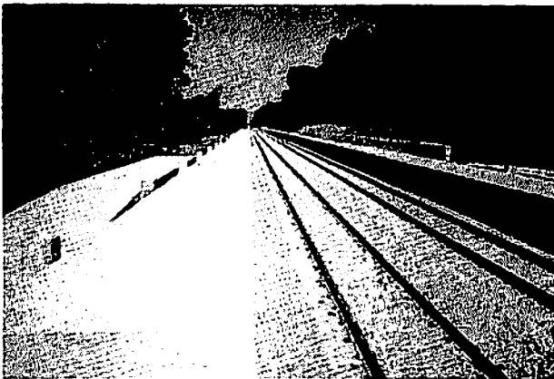
Halifax Station, under construction, located off Rte. 36.

Having had the opportunity to view track and station work and to review signal plans, from an operational perspective, the Old Colony restoration is a first-class railroad resurrection. No effort has been spared to ensure that this investment will serve present and future generations with maximum efficiency and convenience.